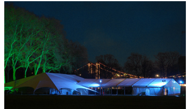
Christmas in Chelsea

The amazing hexagonal reception structures will create a futuristic and very dramatic entrance. Inside, the event design will be simple but striking; clean, contemporary and colourful in reception, leading through to a wonderful conservatory dining area. Add delicious food, a spectacular raised bar area, amazing lighting and a superb DJ, this promises to be one of London's most exclusive party experiences.